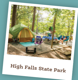
High Falls State Park