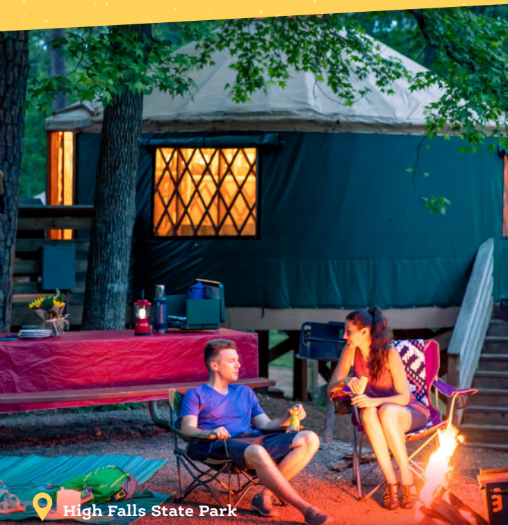
High Falls State Park

A "Great Georgia Road Trip" would be incomplete without visiting High Falls State Park and the state's unofficial Fried Green Tomato capital along the way. The quaint, historic setting of Downtown Forsyth, with its eclectic array of local shopping and dining, is a great place to set up camp for a few days as you explore the incredible adventures to be had nearby!